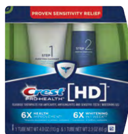
Crest® PRO-HEALTH™ [HD]™ 2-Step System