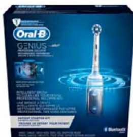
Oral-B® GENIUS™ Professional Exclusive Power Toothbrush

We recommend these Crest® + Oral-B® products to help manage your sensitive teeth: