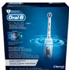
Oral-B® GENIUS™ Professional Exclusive Power Toothbrush