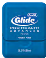
Oral-B® Glide™ PRO-HEALTH™ Advanced Floss