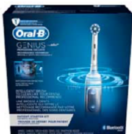
Oral-B® GENIUS™ Professional Exclusive Power Toothbrush