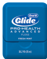
Oral-B® Glide™ PRO-HEALTH™ Advanced Floss